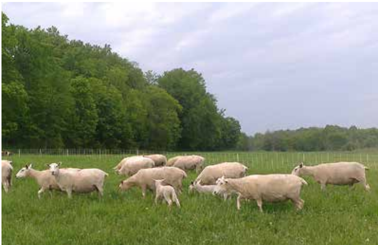
Newborn and very young lambs are most vulnerable to coyote predation

Flocks lambing on pasture in the spring can expect high predation pressure from coyotes during lambing, primarily because lambing in these flocks coincides with pup-rearing, which is one of the highest feed demand periods of breeding coyote pairs. The daily caloric demand of lactating coyotes is estimated to be 2.5 times greater than non-lactating female coyotes. 2 This should be no surprise, since we know that lactation is the peak nutritional demand period for the ewe compared to other stages of the production cycle.