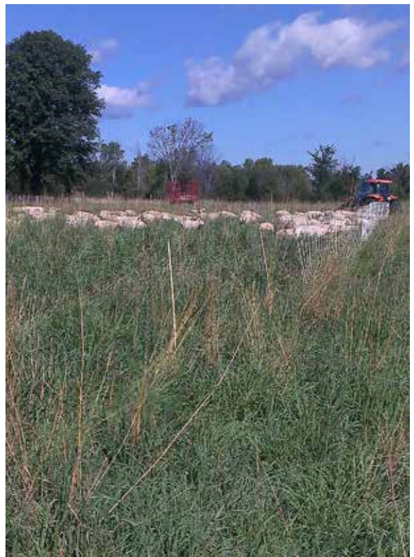
White nets are more visible to the sheep and predators alike.