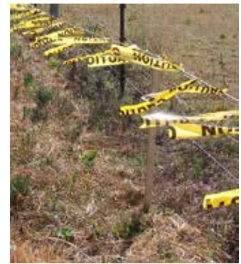
Fladry being evaluated on Ontario sheep farm.

Based on their figures, the table above shows the relative costs of using fladry to protect a half-section (320 acres) pasture. The cost of fladry alone would purchase 50% of the wire needed