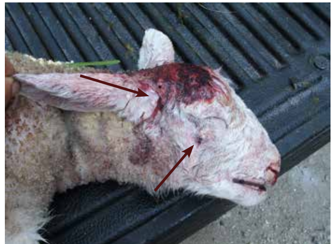
Newborn triplet lamb killed by coyote with bite to top of head.