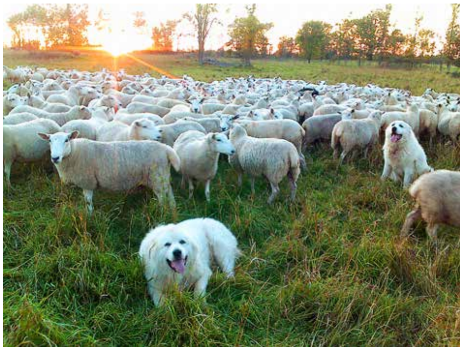
Livestock guarding dogs are the preferred guardian for most lamb producers.

Producers using multiple dogs have found that some dogs work better together than others. Where dogs are used in pairs, it can often be beneficial to switch one of the pair to increase their effectiveness, particularly when coyotes have been constantly challenging them. Paired dogs often show complementary behaviour, 20 with one dog being aggressive and patrolling a wide area around the flock while the second dog stayed with the sheep and responded aggressively only when directly confronted by a predator. A number of producers have observed similar behaviour in their dogs.