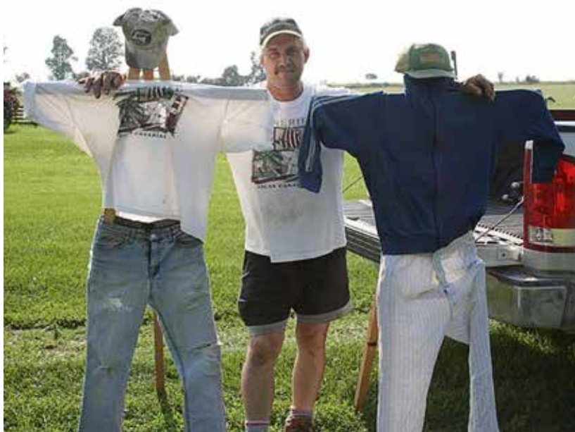
Scarecrows can help keep coyotes out of sheep pastures

Shivik (2004) notes that this concept can be extended to almost anything out of the ordinary that is placed in a pasture or area and startles or frightens predators away. Some producers have left yard lights on over a night pen, or a vehicle parked in the pasture, to discourage predation attempts. Other producers have relied on hanging aluminum pie plates and obsolete CD discs