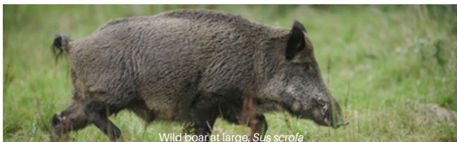
Wild boar at large, Sus scrofa