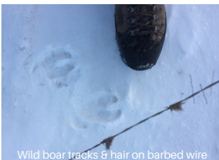
Wild boar tracks & hair on barbed wire